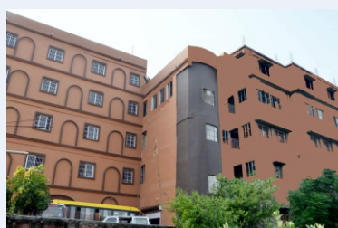
Nursing & Paramedical

Ambedkar Institute of Higher Education Chhitnawa, Danapur, Patna.