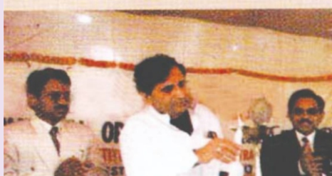
संस्थान द्वारा आयोजित समारोह में मुख्य अतिथि डॉ. शकील अहमद, तत्कालीन स्वास्थ्य मंत्री, बिहार सरकार