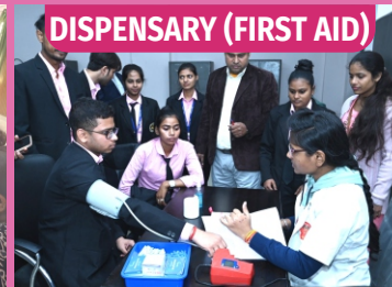
DISPENSARY (FIRST AID)