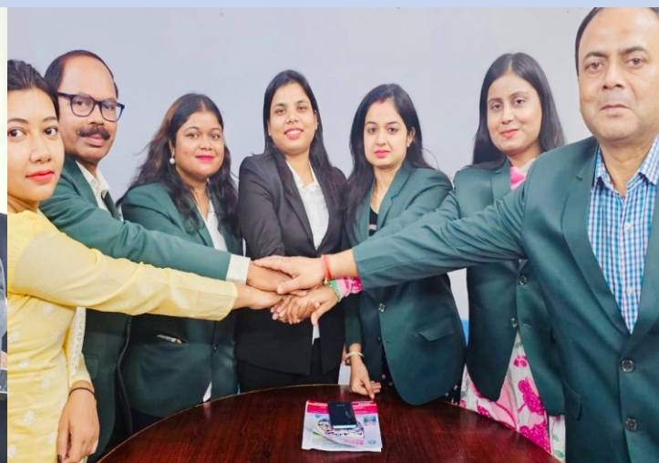
Collaboration and Development Committee, AGI