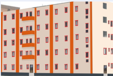
Polytechnic & Management Division

Mamta Institute of Education Chintamanpur, Daraundha, Siwan