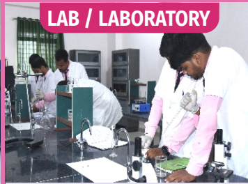
LAB / LABORATORY

We have well equipped language labs at both places with over 200 sets of computers with earphones and hundreds of audio/visual lessons, prepared by professional trainers and linguists.