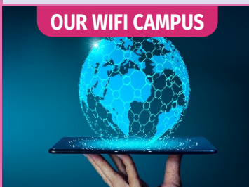
OUR WIFI CAMPUS

Wi-Fi Campus : Our college has full Wi-Fi connectivity for both faculty members and students to help them learn new things and update their knowledge through internet.